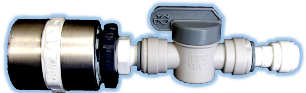
1"x1/2" & 3/8" 61-TKV168F

Tested and Certified by the Water Quality Association (WQA) to NSF/ANSI Standard 61 section 8 and NSF/ANSI 372 for lead free compliance