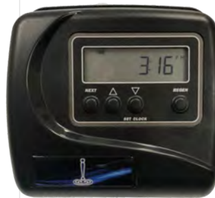
Clack EE Valve

The "Liberator" Carbon/Softener system featuring Vortech! The upper chamber contains a high grade catalytic carbon for the highest levels of chloramine and chlorine reduction. Catalytic GAC is excellent for the reduction of many contaminants including many of the byproducts of chlorine. The lower chamber includes a commercial grade water softening resin for the most luxurious water! Available in many more configurations. Call your customer service representative to discuss custom system designs. Other Clack and Fleck valves are available. 5800 valves require ≈6" additional height for cover removal and are available with a full color touchscreen controller and IOT connected controls. (XTR2, XTRi).